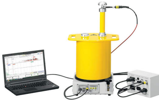
Figure: PD-TaD 62 with laptop and Power Box